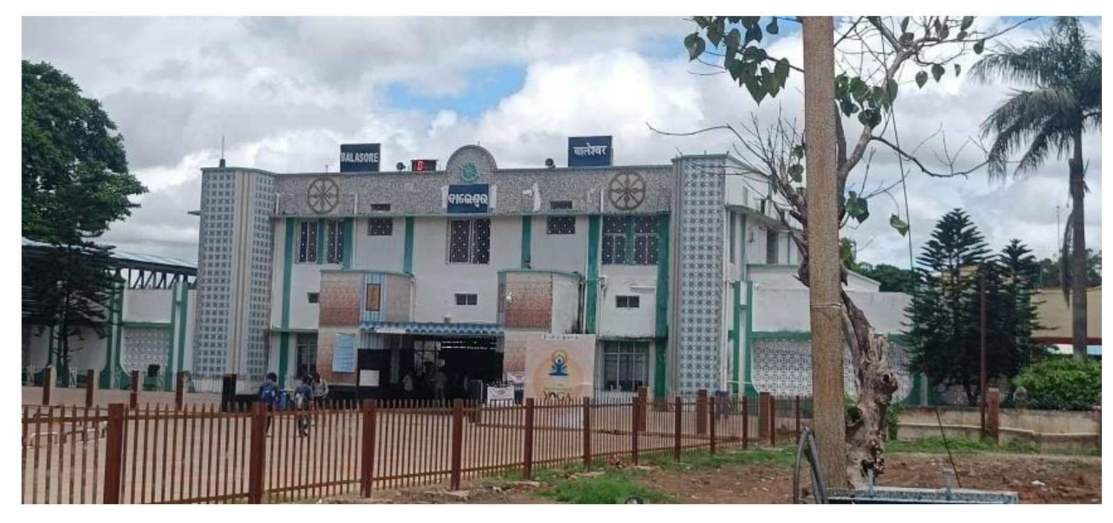
1. Main Station building