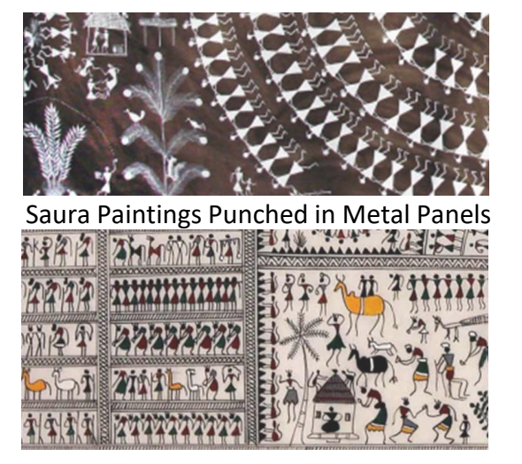
Saura Paintings Etched on Glass Panels