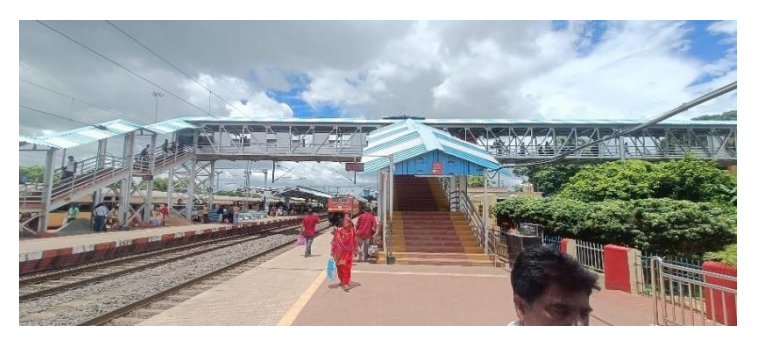
3. FOB towards Bhadrak side